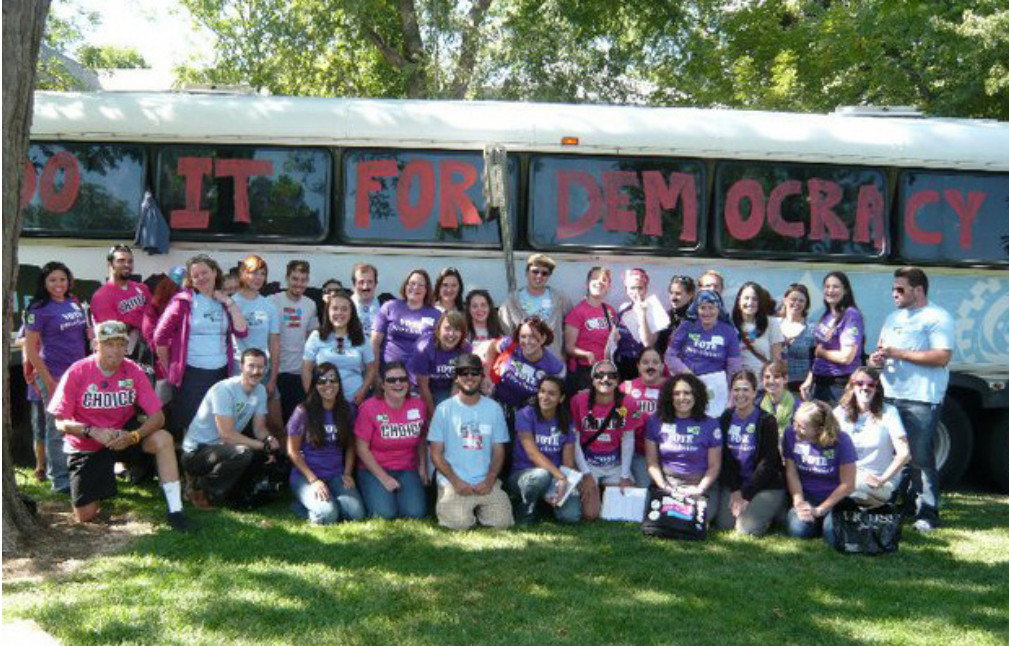
Left: Coalition members get ready to hit the doors in New Era's Democracy Bus.

In November, Colorado voters overwhelmingly rejected three anti-government measures and fought back against attacks on women and communities of color at the ballot. FRESC's 2010 electoral and non-partisan civic engagement work helped defeat Amendments 60 and 61 and Proposition 101, collectively known as the "Bad 3" - harmful and deceptive measures that would have devastated our communities. Numerous Denver area non-profit groups formed a coalition and worked tirelessly to defeat the measures through education and outreach and FRESC is proud to have taken part in this monumental effort.